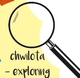
chwilota - exploring