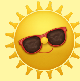
haul - sun