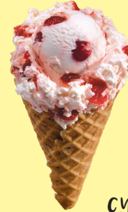
bwyta hufen ia - eating ice cream