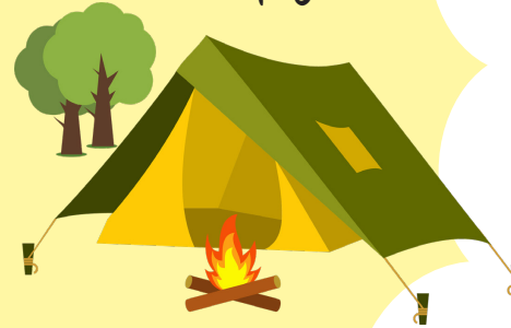
cysgu mewn pabell - sleeping in a tent