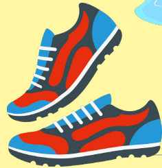
cerdded - walking