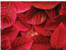
Dail Coch Red Leaves