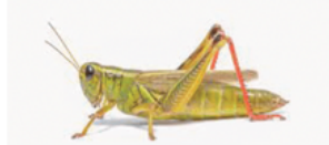
Sioncyn y Gwair Grasshopper