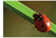
Buwch Goch Gota Ladybird