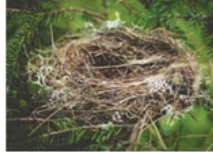
Nyth Adar Birds' Nest