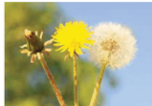
Dant y Llew Dandelion