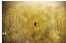
Gwe Pry Cop Spider Web