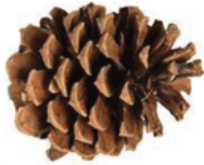
Côn Pinwydd Pine Cone