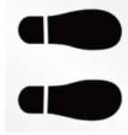
Olion Traed Footprints