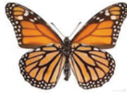
Pili Pala Butterfly