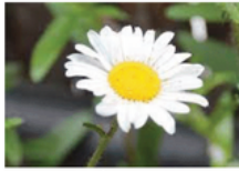
Llygad y Dydd Daisy