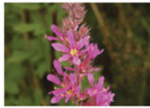
Blodyn Gwyllt Wild Flower