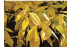
Dail Melyn Yellow Leaves