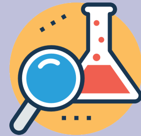
Gwyddoniaeth - Science