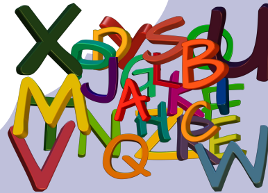
Sillafu - Spellings