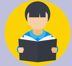
Parllen stori - Reading a story