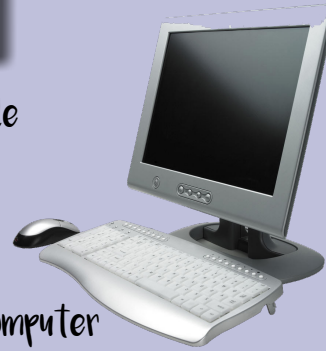
Cyfrifiadur - Computer