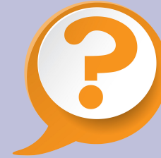
Ateb cwestiynau - Answer questions