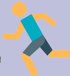
Ymarfer corff - Physical Education