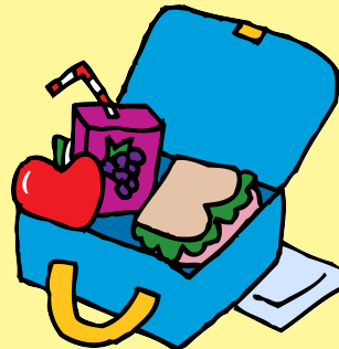
Bwyd a diod Food and drink

Rydyn/Rydan ni'n hoffi ysgol We like school Dydw i ddim / I don't Dwin hoffi / I like Nerfus / Nervous Cyffrous / Excited Edrych ymlaen / Looking forward Anodd / Difficult Pob lwc bawb / Good luck everybody Cadwch yn saff / Stay safe