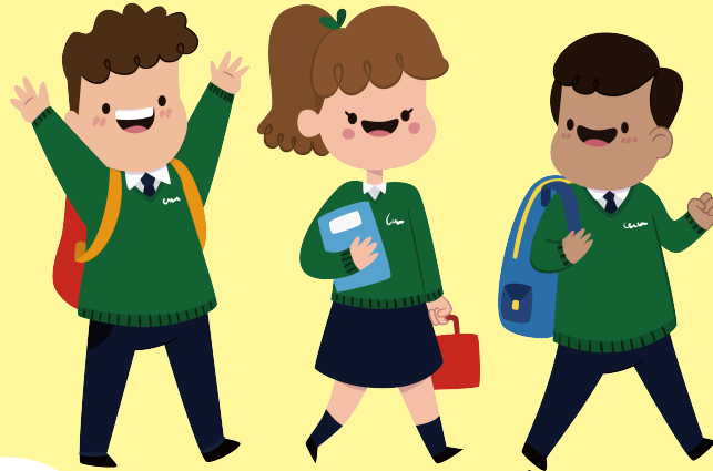
Gwisg Ysgol School uniform